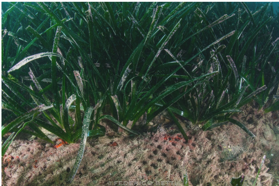
Fig. 2 – Grids used during the first transplanting intervention are still visible on the bottom 23 years later.

Results - The transplanted meadow was still there, and its surface appeared increased. The metallic grids used in the first transplanting were still visible on the bottom (Fig. 2), whilst the stakes used in the second transplanting were not found. The total area covered by the meadow slightly increased in the last 23 years, from 20 m 2 to 24 m 2 (Fig. 3A). The most significant result concerns the shoot density: the estimated number of shoots on the total area covered by the meadow in 2019 is about 4767, with an average value of 195 ± 8 shoots per m 2 , compared to the 61.8 shoots per m 2 in 1996-97 (Fig. 3B). Although the meadow area increased by “only” 17%, the success of transplanting is most evident looking at the shoot density, which increased approximately three times.